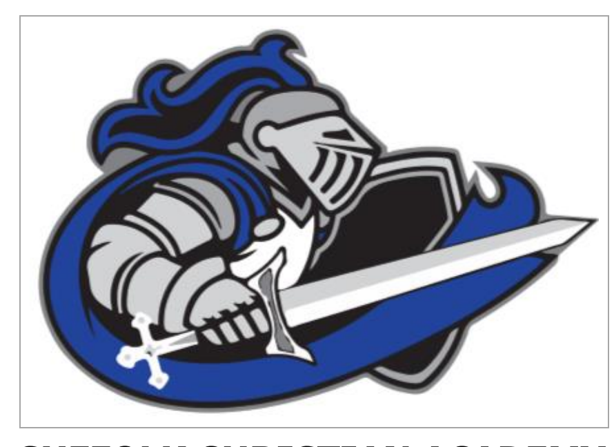
SUFFOLK CHRISTIAN ACADEMY